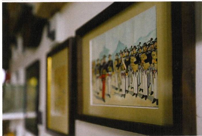
Schronisko dla wiedzy, fot. Klaudia Kot

Muzeum Tatrzańskie im. Dra Tytusa Chałubińskiego w Zakopanem ul. Krupówki 10, 34-500 Zakopane, tel.: +48 18 20 152 05 www.muzeumtatrzańskie.pl