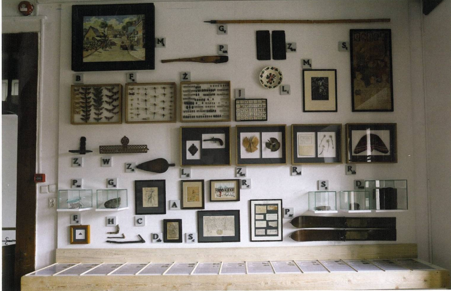
Schronisko dla wiedzy